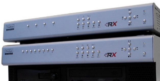
The comprehensive TeleEye RX Series family

TeleEye RX Series carries two ranges of professional digital video recording transmitters, RX360 and RX330 Series. It is incorporated with revolutionary multi-rate video coding technology SMAC-M. With built-in CD-writer, removable hard drive and composite video output design, RX360 makes the recording, storage, retrieval and video monitoring much simple and flexible. RX330 is an all-in-one triplex operating system supporting up to two internal hard drives and composite video output design. Recording rate can attain up to 50/60fps at D1 resolution while video transmission on LAN can achieve 25/30fps. TeleEye RX Series is one of the first video recording transmitters in the world that is compliant to the recognized British Code of Practice BS 8418:2003.