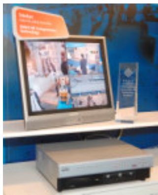
The award-winning TeleEye RX Series

The HKEIA Award was jointly organized by the Hong Kong Electronic Industries Association (HKEIA) and the Hong Kong Trade Development Council (HKTDC), organizer of Hong Kong Electronics Fair and electronicAsia. It aims to recognize and reward companies that achieve excellence of product design, technology and features. The HKEIA Award was announced and presented during the Asia's largest, and the world's second largest electronics show, Hong Kong Electronics Fair.