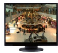
4:3 Standard Resolution