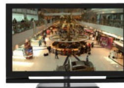
16:9 Wide Screen