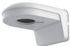
Wall Mount Bracket: WM0203

Terms & Conditions 使用細則 Design and specifications are subject to change without prior notice. Copyright © 2020 Signal Communications Limited. TeleEye is a trademark of Signal Communications Limited and is registered in China, European Community, Hong Kong, U.S. and other countries. All other trademarks are the property of their respective owners.