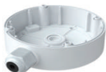
Junction Box: JB0101B