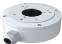
Junction Box: JB0301

Terms & Conditions 使用細則 Design and specifications are subject to change without prior notice. Copyright © 2020 Signal Communications Limited. TeleEye is a trademark of Signal Communications Limited and is registered in China, European Community, Hong Kong, U.S. and other countries. All other trademarks are the property of their respective owners.