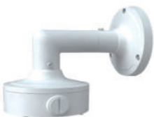
Wall Mount Bracket: JB0207 + WM0407

Terms & Conditions 使用細則 Design and specifications are subject to change without prior notice. Copyright © 2020 Signal Communications Limited. TeleEye is a trademark of Signal Communications Limited and is registered in China, European Community, Hong Kong, U.S. and other countries. All other trademarks are the property of their respective owners.