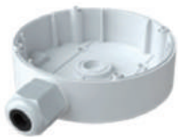
Junction Box: JB0207