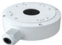
Junction Box: JB0302

Terms & Conditions 使用細則 Design and specifications are subject to change without prior notice. Copyright © 2020 Signal Communications Limited. TeleEye is a trademark of Signal Communications Limited and is registered in China, European Community, Hong Kong, U.S. and other countries. All other trademarks are the property of their respective owners.