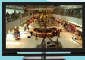
16:9 Wide Screen

One of the key components of TeleEye Turnkey HD Surveillance System is TeleEye MX Series HD Video Cameras. MX Cameras comply with the common HDTV standard and offer the resolution of 1280 x 720 pixels (720p) with 16:9 wide screen aspect ratio. The wide screen format provides 33% more viewing area and much better clarity when compared with conventional cameras. The resolution of MX Cameras is over 800 TVL which exceeds most of the conventional cameras with maximum 540 TVL. MX Cameras also employ progressive scanning technology which ensures the images have less distortion and jaggedness when looking at fast moving objects.