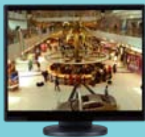
4:3 Standard Resolution